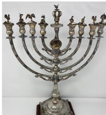
A beautiful Menorah from Hungary, 1940s. All the toppers are images of Kosher animals.