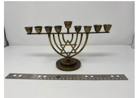
A Menorah from Eastern Europe, mid-1900s.