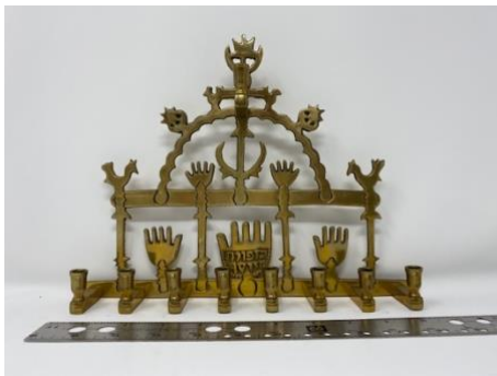
A Menorah from the Middle East.