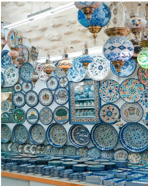
Tel Aviv District