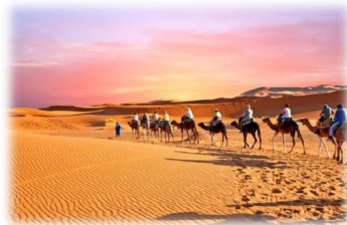
Cityscapes and desert images from Morocco.