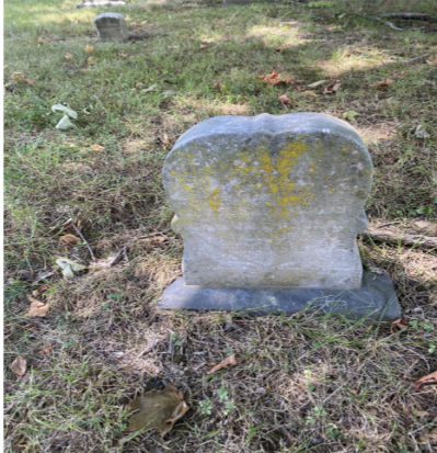
When Zola was cleaning it.

Here is one of the children's stones from the 1930's: