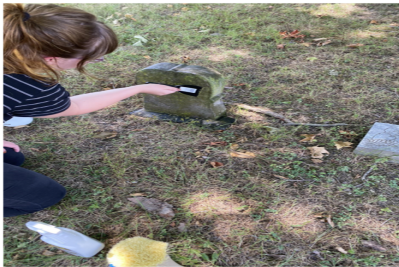
The clean stone.

We are looking for volunteers to help and learn. They don't have to be members of B'er Chayim. Please let us know of any grave markers you would like cleaned or any you wish not to be disturbed.